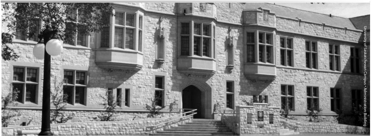
University of Saskatchewan Campus • Administration Building

For more information on the course, please visit: http://math.usask.ca/mrc-info/math_readiness.html